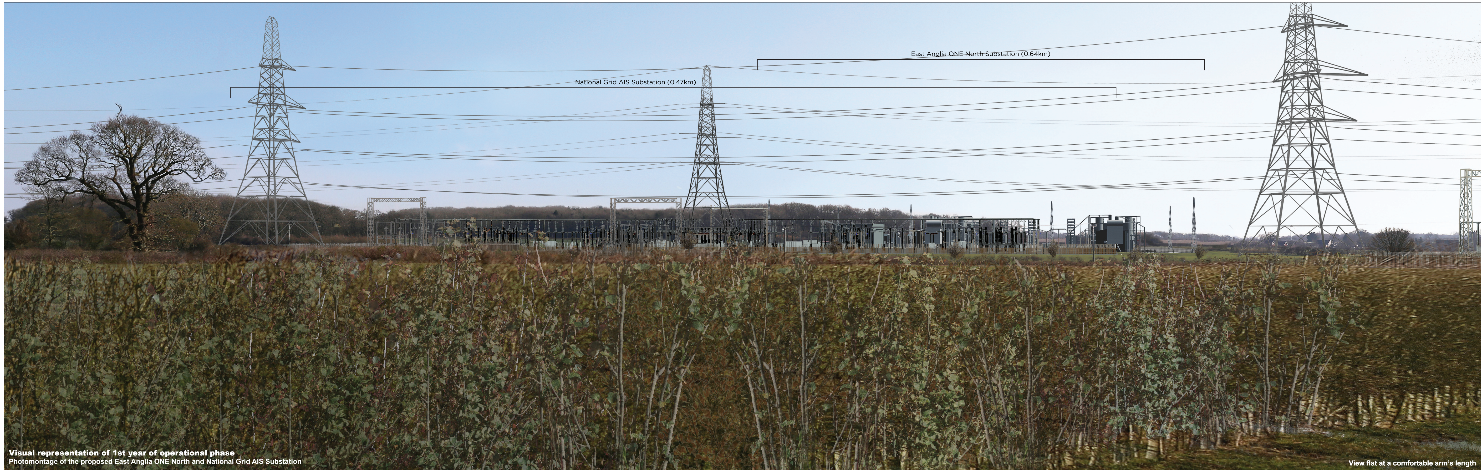
Visual representation of 1st year of operational phase Photomontage of the proposed East Anglia ONE North and National Grid AIS Substation