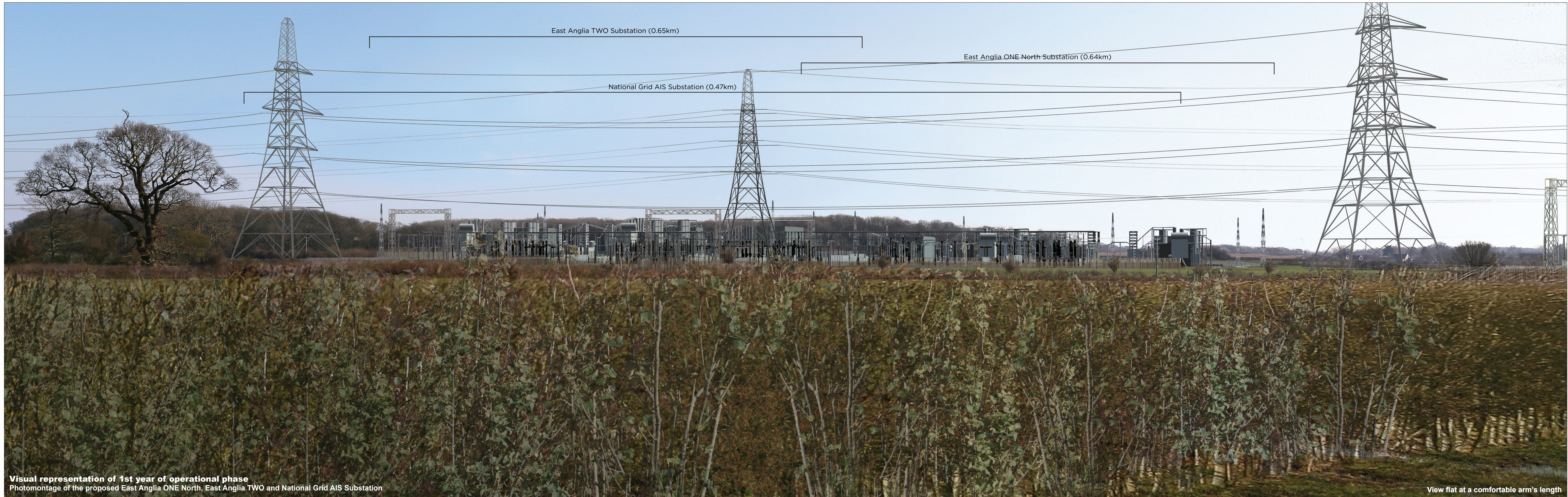
Visual representation of 1st year of operational phase Photomontage of the proposed East Anglia ONE North, East Anglia TWO and National Grid AIS Substation